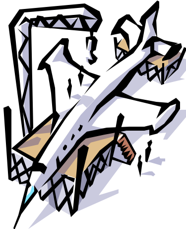
Serving dinner under a Boeing 757 presented special challenges

Every stage of the event was tightly scripted. To accom-